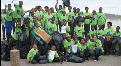
Mount Pleasant Primary scholars with their loot at Orkus

In South African waters, many species (birds, fish, turtles and mammals) listed in the Red Data Book suffer and die from eating marine litter.