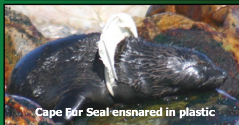
Cape Fur Seal ensnared in plastic