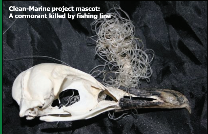
Clean-Marine project mascot: A cormorant killed by fishing line