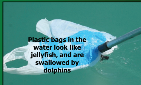
Plastic bags in the water look like jellyfish, and are swallowed by dolphins