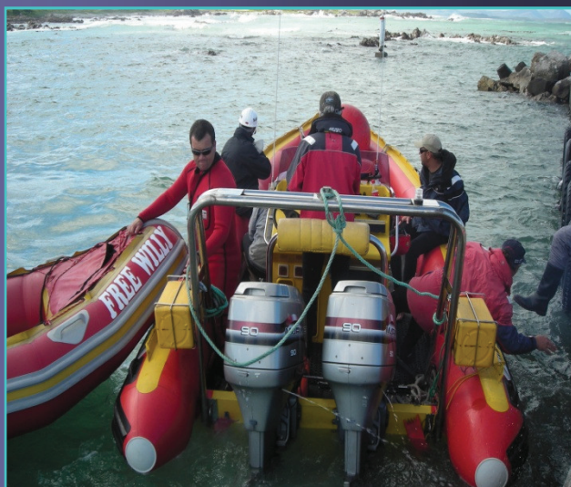
DICT's zodiac "Free Willy" is used to get closer to the whales to facilitate disentanglement.