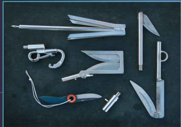
Specially designed grappling and cutting tools are used to cut away the offending gear while causing as little harm to the whale as possible.

Dyer Island Conservation Trust (DICT) works in partnership with the South African Whale Disentanglement Network (SAWDN) in conjunction with Oceans & Coasts (previously Marine & Coastal Management) and CapeNature . Using specifically designed tools and following special safety protocols, we are able to cut away the ropes and gear from the animal. Since its inception SAWDN has been able to free more than a dozen whales off the coast of South Africa.