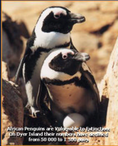
African Penguins are Vulnerable to Extinction. On Dyer Island their numbers have declined from 50 000 to 1 500 pairs.