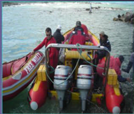
DICT's zodiac "Free Willy" is used to get closer to the whales to facilitate disentanglement.

Our specially designed grappling and cutting tools to cut away the offending gear while causing as little harm to the whale as possible.